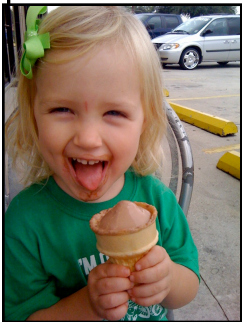
Everly enjoyed Grandma & Grandpa visiting which meant a few trips for ice cream!