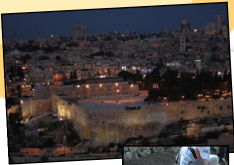
City lights in Jerusalem and plating a tree at a Holocaust memorial.